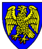
City of Oroslavje

City: Stubičke Toplice Viktora Šipeka 45